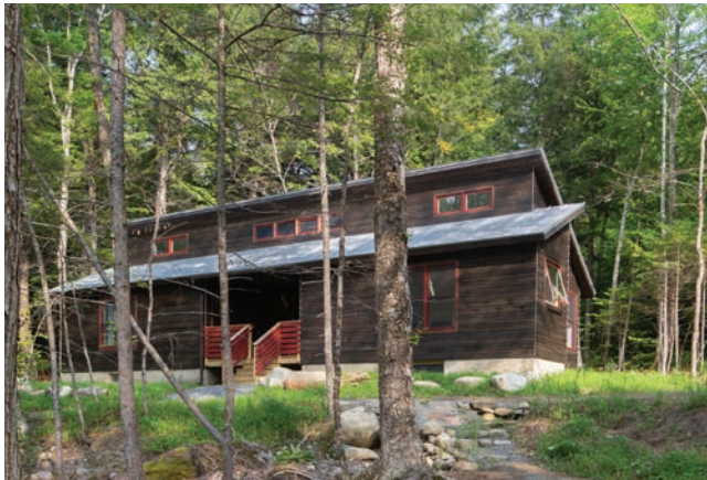
STAFF COTTAGES by Alan Wanzenberg COMPLETED 2021