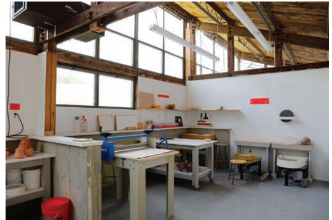
POLLOCK-KRASNER CERAMICS STUDIO by Neil Kittredge, Beyer Blinder Belle COMPLETED 2019