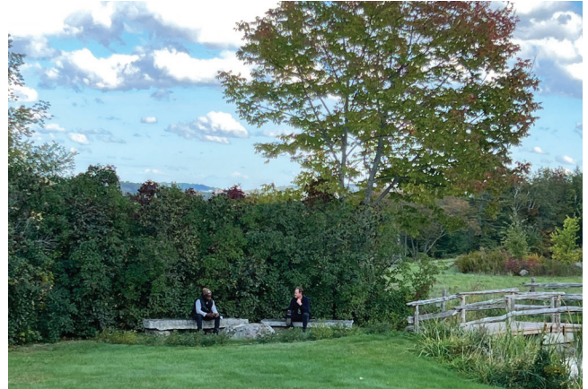
NATURAL AMPHITHEATER SPACES by Hood Design Studio EXPECTED COMPLETION 2023/2024