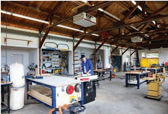
ACQUAVELLA SCULPTURE SHOP by Neil Kittredge, Beyer Blinder Belle COMPLETED 2019